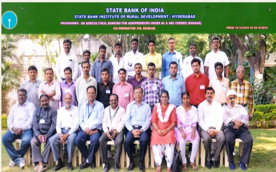
Refresher Training program at State Bank Institute of Rural Development ,Hyderabad

A Refresher Training Programme on “Agriculture Banking” under Agri-Clinics and Agri-Business Centres (AC&ABC) Scheme” was organized during 18 th to 22 nd October, 2016 at State Bank Institute of Rural Development, Hyderabad, Telangana State. Twenty seven agripreneurs participated from states of Uttar Pradesh, Maharashtra, Tamil Nadu, Pondicherry and Karnataka. The programme covered topics relating to Agriculture Banking viz. Business opportunities in Agriculture, Project Approach and Financial Analysis, Minor Irrigation & project preparation, Dairy Financing & project preparation, Financing Farm Mechanization & project preparation, Financing Poultry & Project Preparation, Business Correspondents (Agriculture), Farmer producing Companies, Horticulture & Project preparation etc.