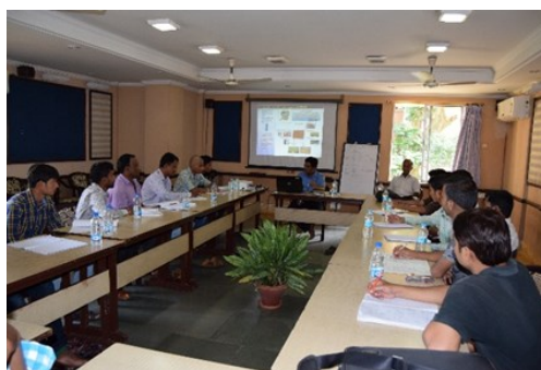
Trainees at CYSD, Orrisa

The third batch of the AC&ABC Scheme is scheduled to start in the second week of January 2017. MANAGE, Hyderabad extends its best wishes.