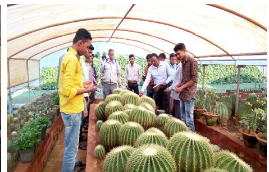
Trainees at field visits