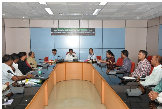
Refresher training program at IIHR-Bangalore

A Refresher Training Programme on “Business Opportunities in Horticulture” under Agri-Clinics and Agri-Business Centres (AC&ABC) Scheme” was conducted during 18 th to 22 nd October 2016 at Indian Institute of Horticulture Research, Bangalore, Karnataka. Twenty eight agripreneurs participated in the training programme. The programme covered aspects related to Horticulture, viz. Horticulture industry as a Business Opportunity in India, Business Opportunities in Nursery for Quality Planting Material Production with Precision Farming in Fruits, Vegetables, Ornamental and Medicinal Crops for Domestic Markets and Export Abroad, Designing and fabrication of structures and Protected cultivation of high value vegetables and ornamental crops like flowers and fruits, Vegetable seed industry and Management, Integrated nutrient, water, pest and disease management including soil health management in horticulture crops, Business Opportunities for small scale entrepreneurs in Post-Harvest Management and Value Addition in Horticulture Crops, Business opportunities in production and export of plantation crops, Management of Tropical Mushroom Production. IIHR-Bangalore was organized a visit to farmers fields.