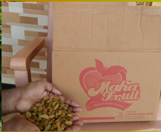
Maha Fruit Brand Name