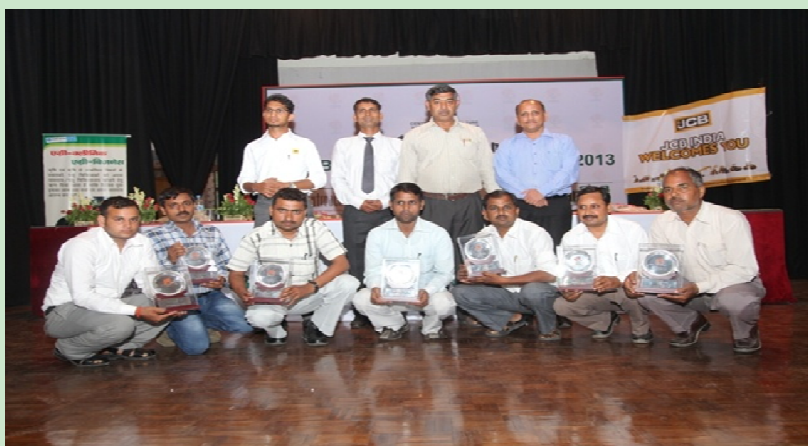
The seven best Agripreneur awardees with Director, CAD, MANAGE at ACABC conclave and UP 1 st ACABC Awards 2013 organized by CARD on 31 st May, 2013.

Though efforts were made to bring overall development of Agripreneurs, around 41% of the trained candidates have established Agri-input centres because of the nature of early returns from Agri-input supply. As Dairy also gives early returns and ensures sustainability, around 35% ventures are dairy units thus making it as the second most important component of agribusiness industry. Others are poultry, horticulture nursery, bio-fertilizer units etc.