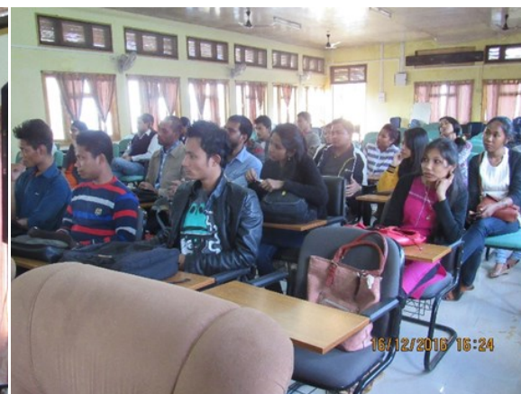
Trainees at NEHU Tura, Meghalaya