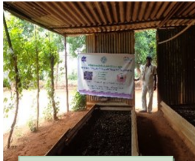
Vermi-compost unit established by inmates at Cherlapally Central Prison, Hyderabad