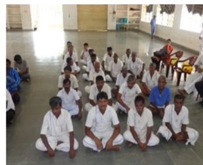
Inmates during training

www.agriclinics.net is the portal providing information about Agri-Clinics and Agri-Business Centres Scheme. The portal gives updates on eligibility criteria, training institutes, training progress, handholding activities, finance options and subsidy to the prospective Agripreneurs. The website also provides information on details of established Agri-ventures, pending projects, relevant schemes etc., and other information useful for State governments, Agricultural Universities, Banks, Training Institutes and Agripreneurs.