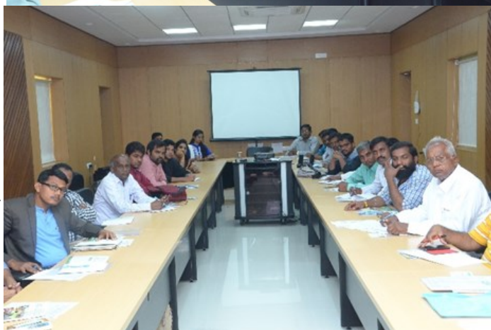
One day workshop on “MANAGE certified Agricultural Consultancy and Agri-preneurship Development” at MANAGE-Hyderabad