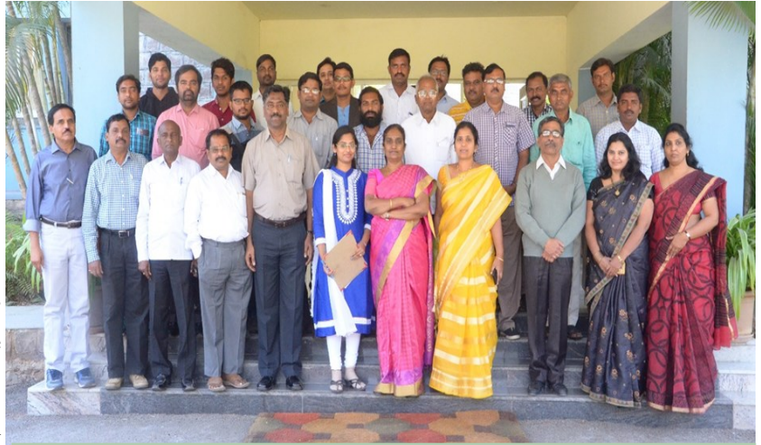
Agripreneurs at one day consultative workshop at MANAGE-Hyderabad

This model consists of a call centre with a toll free number to which farmers' call to seek information or advice or solutions to their problems. Thereafter, the tele-adviser collects information about the farmers (Name, Address, Phone Number etc.) and approaches private agricultural consultants in the respective operational territory. Private agricultural consultants who approach the farmer who is in need of the agricultural service. Farmers need to pay a prescribed fee to the private consultant for the service. As a pilot, this model will be implemented in Telangana and Andhra Pradesh States.