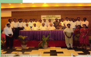
Valedictory Function Participated by CAD MANAGE Consultant & AGM NABARD, Namakkal