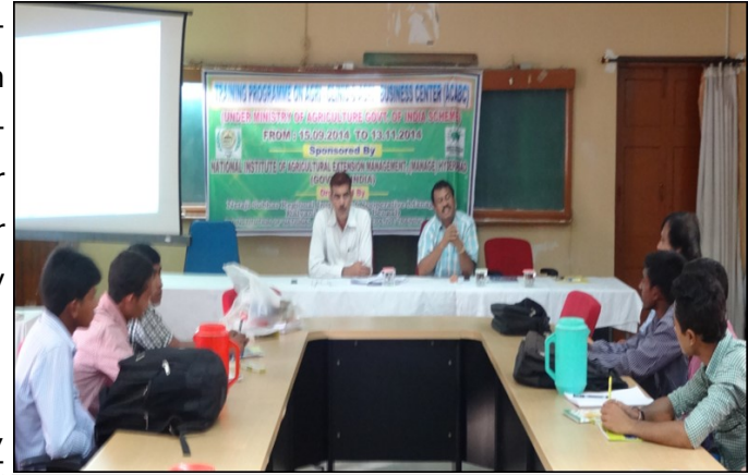
Awareness campaign on AC&ABC scheme to the Agriculture Diploma students of Kalyani University was held on 11<sup>th</sup> Nov.2014

NSRICM's mission is to guide the personnel of Cooperatives, Allied departments and Cooperative organizations situated in West Bengal, Tripura, Andaman & Nicobar islands and Sikkim in improving their managerial skills and helping to achieve the noble objectives of cooperatives through adaptation of modern managerial techniques. It