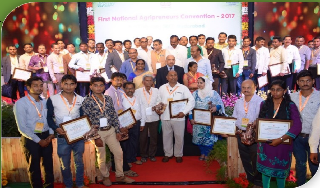
All Awardee Agripreneurs from 25 states in India