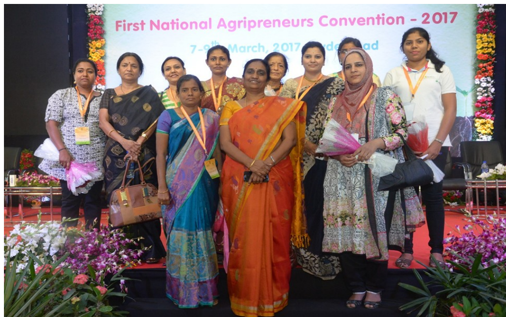
Successful Women Agripreneurs during Women's Day Celebration at Convention