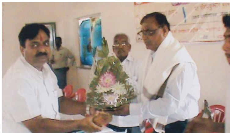
SPM and ATMA, Solapur conducted a collaborated program for Sugarcane Grower

“Extension through Entrepreneurship” is the prime concept of the centrally sponsored AC&ABC Scheme. Since 2010, Shriram Gramin Sanshodhan evam Vikash Pratishthan Mandal (SPM), has been implementing the AC&ABC Scheme through its six regional centers at Wadala, Ratnagiri, Osmanabad and Akola in Maharashtra; Belgaum in Karnataka and Raipur in Chhattisgarh. The organization regularly conducts workshop, training, and seminars for Bankers and other Stakeholder to strengthen implementation of AC&ABC Scheme. SPM and ATMA jointly conducted a one day seminar on “Inter-cropping in Sugarcane and its advantages” at Bhandarkawathe, Solapur. The Dy. Director, ATMA was present at the event.