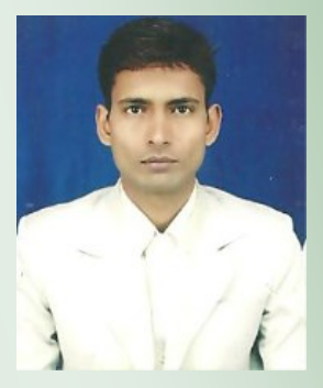
Name of NTI: Centre for Agriculture and Rural Development (CARD)

Address: Agri-clinic & Agribusiness Training Centre, Reshu Chowk, Circular Road, Near Sri Sai Hospital, District, Mujaffernagar, Uttar Pradesh – 251 001