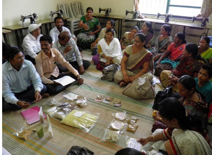
Agripreneurs showcasing their products in workshop

wards agro-based enterprises so that they can get self-employed.