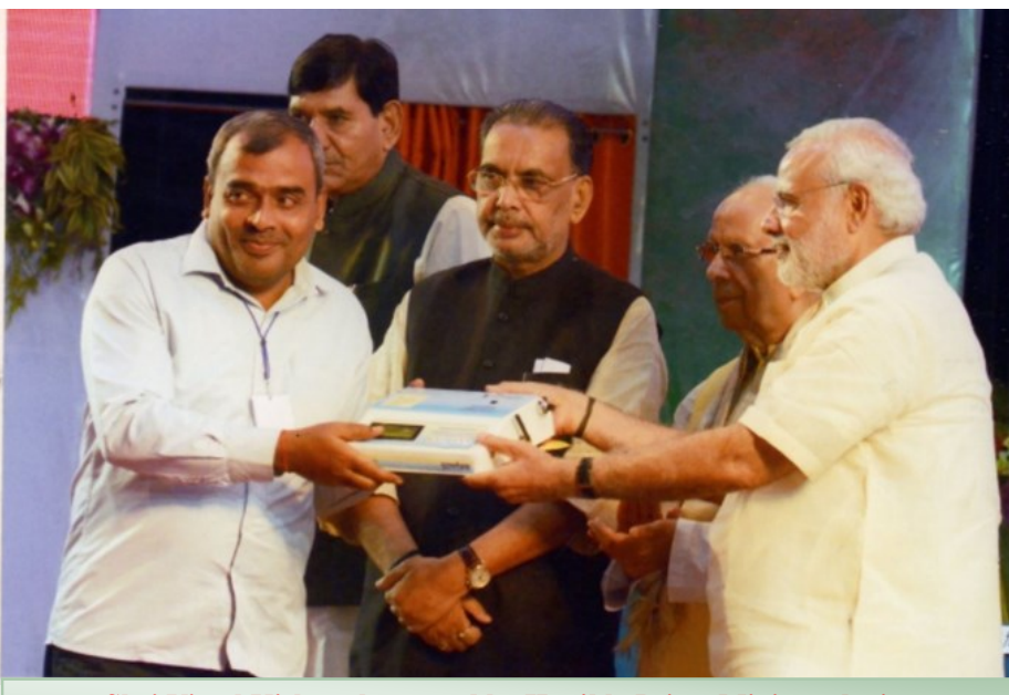
Shri Vimal Kishore honoured by Hon'ble Prime Minister during ICAR foundation day-2015

preciated the initiative of ICAR to celebrate its Foundation Day at Patna, Bihar from where agricultural research was initiated in country the through establishment of agricultural research institute way back in 1905.