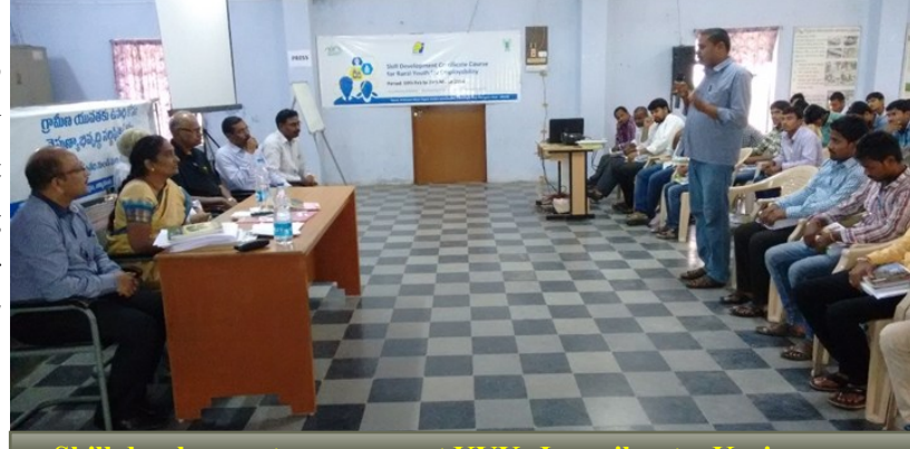
Skill development programe at KVK, Jammikunta, Karimnagar

portant objective is to develop skill among rural youth so that they can be gainfully employed by the Agri-input manufacturing and marketing Industries to market their products through extension / marketing and sales activities and help farmers achieve high level of farm productivi-