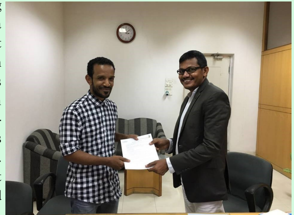
MoU Signed between IIFSA and S&P