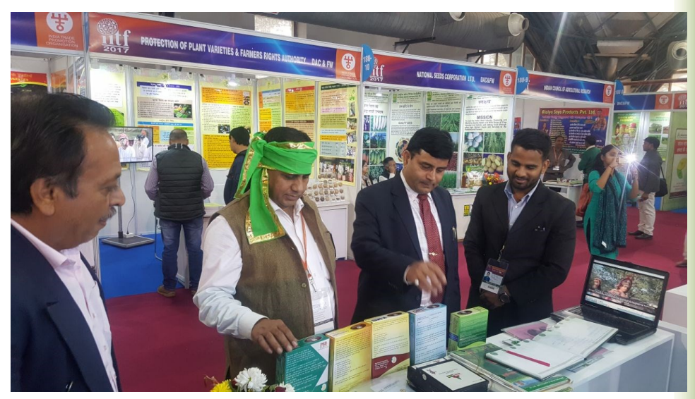
Delegates visited MANAGE-ACABC Stall at IITF-2017, Pragati Miadan, New Delhi

The President of India, Honorable Shri. Ram Nath Kovind, inaugurated the 37<sup>th</sup> India International Trade Fair (IITF) - 2017, on November 14, 2017 at Pragati Maidan, New Delhi. He spoke about the introduction of GST and mentioned that it is a milestone and the new regime has reduced barriers between states, creating a more formal economy. "Startup India Standup India" was the theme selected for this year's event. The theme complemented the objectives of the AC&ABC Scheme quite well.